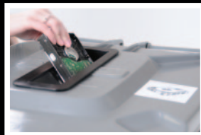
Hard drive cart with Lockjaw® lock and label (shown left)