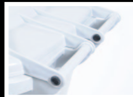
Handles allow for full control when moving cart