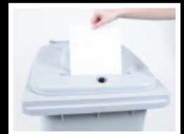
Provides secure collection of documents