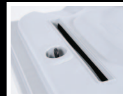
Lid with molded paper slot