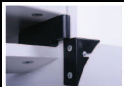
180 Degree nylon hinge for unobstructed collection