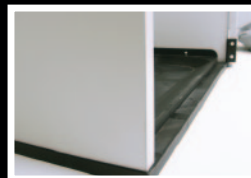
Durable modular base slides easily and supports door in all directions.