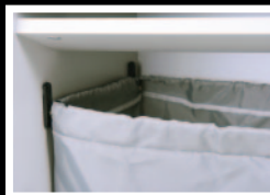
Nylon bag hooks makes bag fit tight. No paper misses the bag.